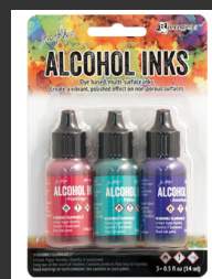
Left: Different color patterns on 3D printed Easter eggs using alcohol-based ink. Right: Tim Holtz® Alcohol Ink Kits used on the eggs.

Remember to send your pictures to spplwincenter@gmail.com or share and tag us on social media. #madeitatSPPL #learndoshare